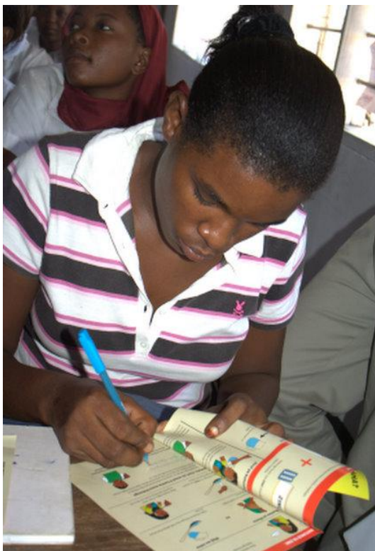
POUZN created simplified, graphic materials for ADDOs.

at these general stores, but they are invariably available. To provide the great majority of Tanzanians with more reliable and convenient access to essential medicines, the government has taken on an ambitious project over the past several years of upgrading the skills and assuring the quality of drugs in many of these outlets. Those that complete the process successfully are known as accredited drug dispensing outlets —or ADDOs—and can prescribe essential medicines (see box).