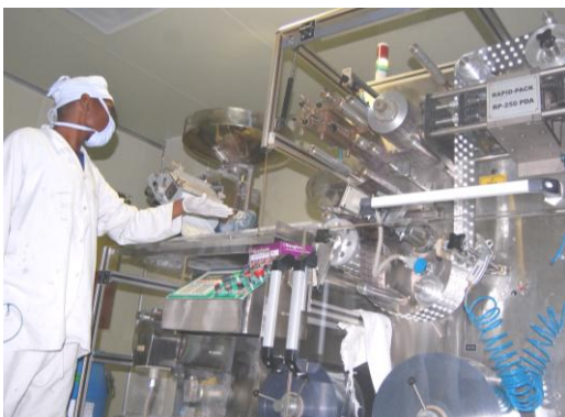
Shelys had constructed a new manufacturing plant in 2004 in anticipation of expanding its market.

During this extended period of advocacy with the government, POUZN meanwhile moved systematically to stimulate zinc production in the country and launch the product in the private sector. In 2005-6 the project carried out an assessment of Tanzanian drug manufacturers to identify those having the potential to produce and market zinc. The project sought a formal partner or partners. Criteria included multiple factors (see box). Of the five local pharmaceutical companies, three were promising. However, one company was reluctant to invest the necessary funds in a new product, and a second wanted to wait until zinc was added to the essential medicines list—since an estimated 65 percent of zinc demand in the country was projected to come through the public sector.