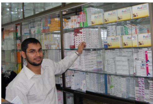
Shelys ensured that all 375 pharmacies in the country had information about zinc

Pharmacies. POUZN collaborated with the Pharmacy Council of Tanzania to provide updated guidelines to pharmacies in five major cities. The project created leaflets, point-of-purchase signs and danglers, T-shirts (as incentives for those making sales over a certain threshold), stickers, notepads with zinc treatment messages, fliers for clients, and other promotional materials to motivate sellers as well as potential clients.