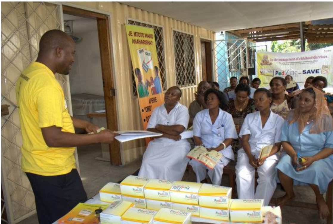
The project collaborated with MSH to conduct training-of-trainers for health workers.

POUZN collaborated with the TFDA and Management Sciences for Health (MSH) in introducing new diarrhea treatment management guidelines into the training of these ADDOs. The project designed both refresher training for shops that had already been upgraded, and a revised IMCI chapter for the regular “course.” POUZN printed 5,000 job aids as well as manuals for the training, and designed a training-of-trainers program including role plays for different client scenarios. POUZN also supported training for the CHMT staff, who are responsible for supervising ADDOs—as well as all public dispensaries and health posts in their districts. By year four of the project, sales of zinc in ADDO regions reached levels similar to those in Dar es Salaam—indicating major expansion into rural areas. By the end of the project, the ADDO program will have covered 13 of Tanzania’s 21 mainland regions, reaching areas where