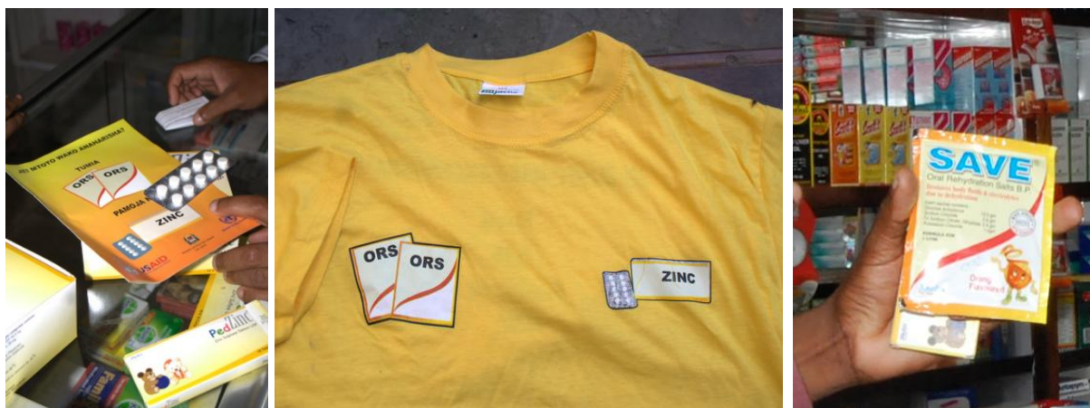
Shelys agreed to co-promote zinc with ORS (including its own brand, SAVE ) in all of its marketing materials.

The partnership moved ahead quickly. POUZN brought in United States Pharmacopeia (USP) through another USAID contract to assess Shelys manufacturing and quality assurance procedures. USP determined that the new plant was well-designed and had excellent facilities (with the exception of a ventilation system that needed upgrading), but operating procedures were not completely in line with GMP standards. In July 2007 POUZN contracted with CRMO Pharmatech, an India-based firm, to conduct a gap analysis for upgrading procedures: from receiving to warehousing, production, cleaning, quality control, stability testing and shipping. Shelys invested about $1 million to