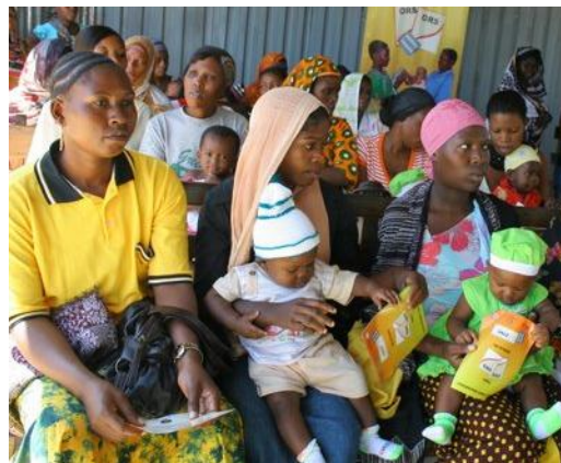
The project launched a variety of zinc promotional activities at the village and health post level.

In 2008, the Tanzania Zinc Task force requested that POUZN take the lead in designing a strategy to coordinate public and private sector communication to caregivers about zinc. The project held a day-long workshop with key stakeholders