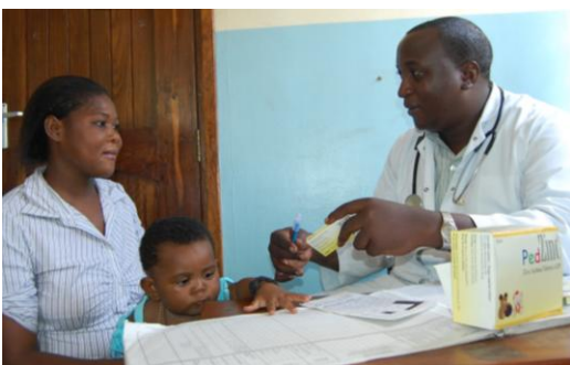
POUZN targeted the prescribing behaviors of both private and public physicians.

POUZN took a very opportunistic approach to reach the upper tier of public health physicians in the project’s early months, given the government’s reluctance to create demand while supply was uncertain. Building on good relations with the IMCI Department, POUZN (working with WHO, UNICEF, and Shelys) was able to put zinc on the agenda of the annual IMCI malaria conference in July 2008. This event was attended by all of the country’s Regional Medical Officers and many District Medical Officers. Again, the focus at this level was on the clinical basis for changes in diarrhea management, although both Shelys and UNICEF also discussed supply issues.