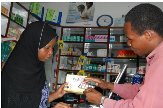
PedZinc was first launched in commercial outlets.

implement the recommended changes. CRMO continued to provide advice to Shelys over subsequent months regarding zinc tablet documentation for the TFDA, preparation of a dossier to be submitted to UNICEF, and so forth.